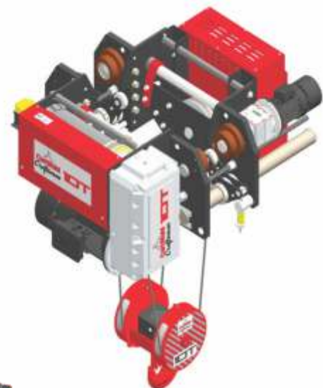
WIRE ROPE HOIST Product Range: 2 Ton to 10 Ton