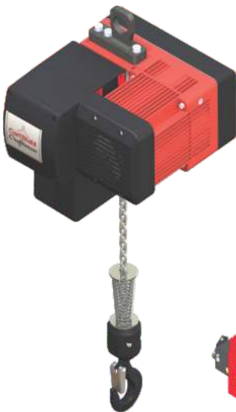
CHAIN HOIST Product Range: 125 Kg to 3.2 Ton