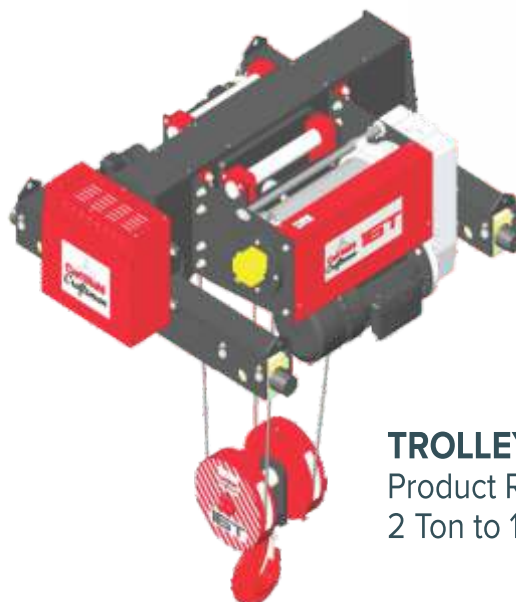
TROLLEY / CRAB Product Range: 2 Ton to 16 Ton